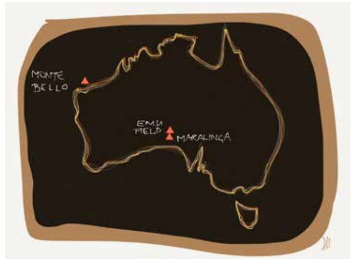
Australian nuclear weapon test sites

Omitting testing from the prohibited activities in the nuclear weapon ban treaty would only serve to exacerbate the CTBT's current problems, including its lack of entry into force. It could leave a crucial gap in the treaty's core prohibitions that will be instrumental in preventing future development of or reconstitution of nuclear arsenals.