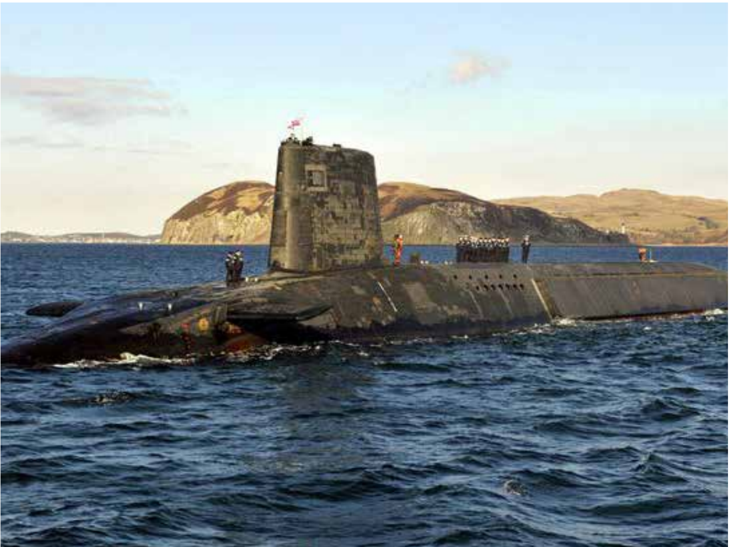
Trident nuclear submarine

In this vein, the memo to NATO allies cited above specifies that a number of the treaty's proposed prohibitions related to transit, port visits, overflights, deployment, and stationing "could make it impossible to undertake ... nuclear-related transit through territorial airspace or seas." It also admits that because the United States "neither confirms nor denies the presence or absence of nuclear weapons on U.S. naval ships," such prohibitions "could make it impossible for these