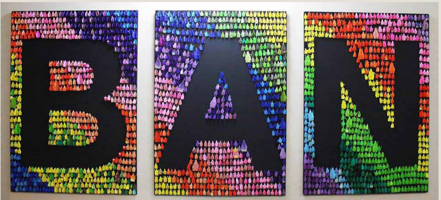
Mural by Tatsuya Tomizawa, made with thousands of hand-folded paper cranes. Melbourne, 2015.

These understandings have led the vast majority of governments to support the negotiation of a legally binding treaty to prohibit nuclear weapons, leading to their elimination. An international instrument that outlaws nuclear weapons based on their unacceptable consequences would put nuclear weapons on the same footing as the other weapons of mass destruction, which are subject to prohibition through specific treaties. Such a treaty has the transformative potential to codify the illegality of nuclear weapons, stigmatise and prevent their possession as well as nuclear "deterrence" practices, and help facilitate nuclear disarmament. This paper outlines the core prohibitions necessary for such a treaty to be effective in meeting these objectives.