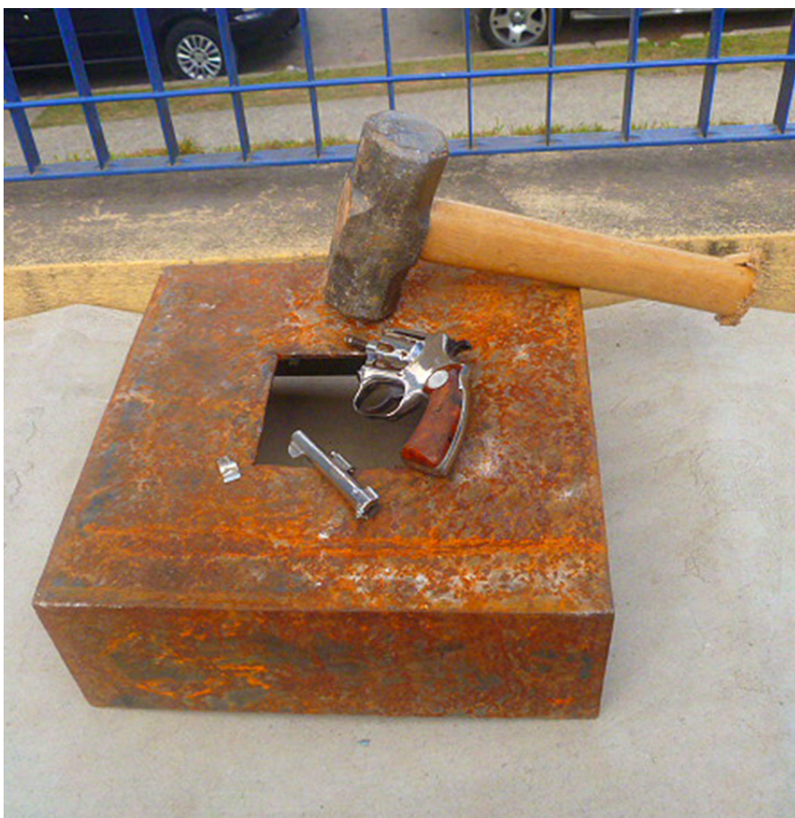
Instituto Sou da Paz

What would be those ten global agendas for armed violence? In all honesty, we do not know—there may be none for some of the issues mentioned above. But asking bigger, broader, prospective questions could be helpful as we attempt to see the entire forest rather than only the single trees we have become accustomed to zoom in on.