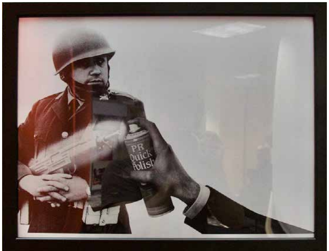
Image part of the Art the Arms Fair in protest of DSEI arms fair in London

In the meantime, the original right of reply to Amnesty has similarities to “gaslighting”—in which someone in a dominant position attempts to undermine someone else’s sense or understanding of a situation. In this case, a government representative of a