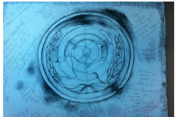
Art by Lin Evola

Identifying a reasonable EIF formula is a challenge to those crafting all new treaties and conventions and the ATT is no exception. In light of this challenge, the EIF provisions must be understood as facilitating the long-term success of the ATT so that legally-binding, international standards for the trade in conventional arms are implemented as soon as possible rather than being held up due to a lack of sufficient ratifications. If the single-number formulation is kept at a reasonable level, states parties that have signed on will be able to begin implementation of the Treaty's provisions while encouraging others to do the same. •