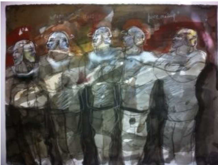
Art by Lin Evola

Our task at this point is not to concern ourselves with running the perfect race, but in getting to the finish line with a text that identifies and addresses the most egregious barriers to a fair and effective treaty and, if that happens, retaining enough good will to keep that text active, allow for its continual improvement, and attend to an array of complementary security concerns. •