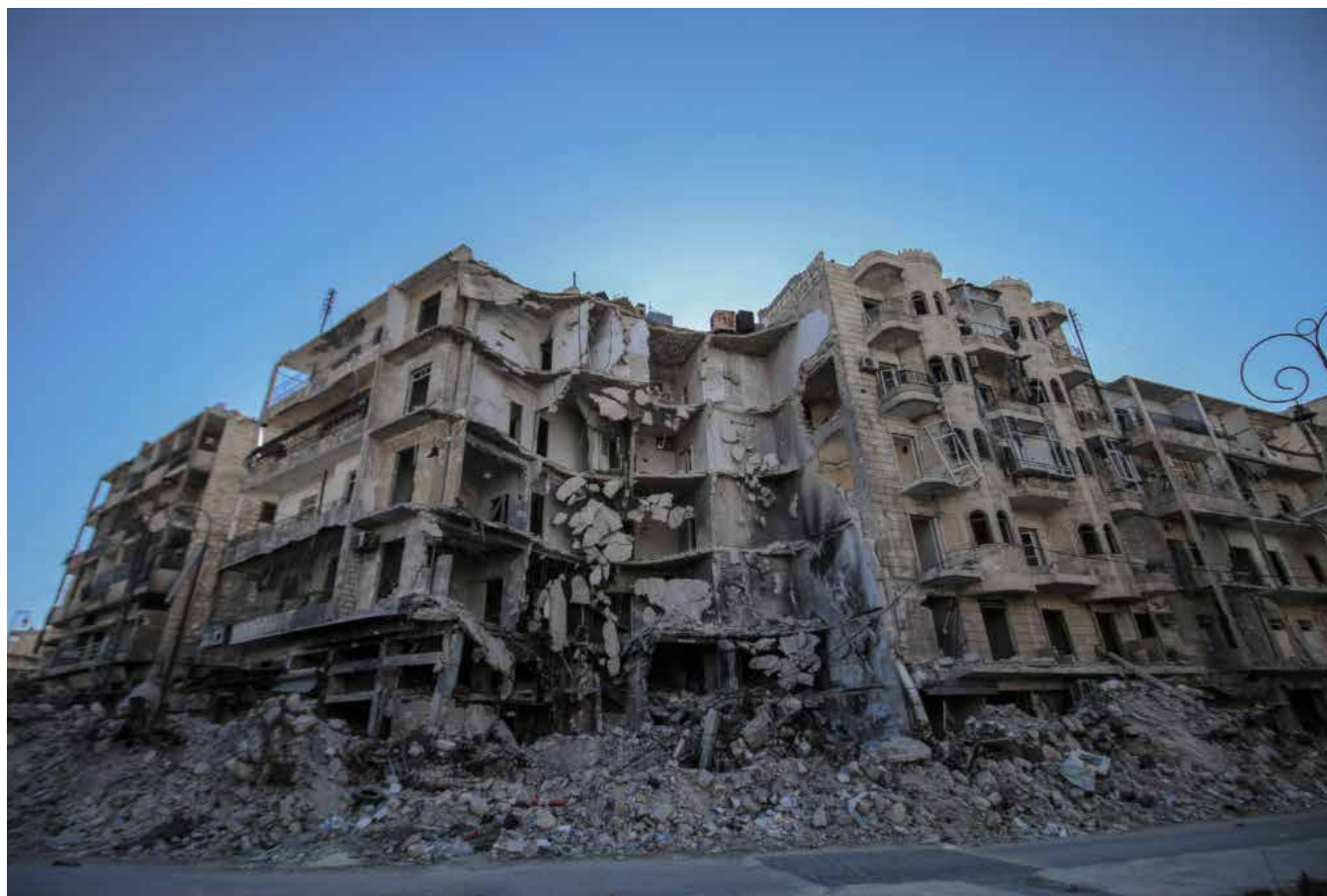
Eastern Aleppo

Once again, women are suffering disproportionately and are in grave danger. According to local yet