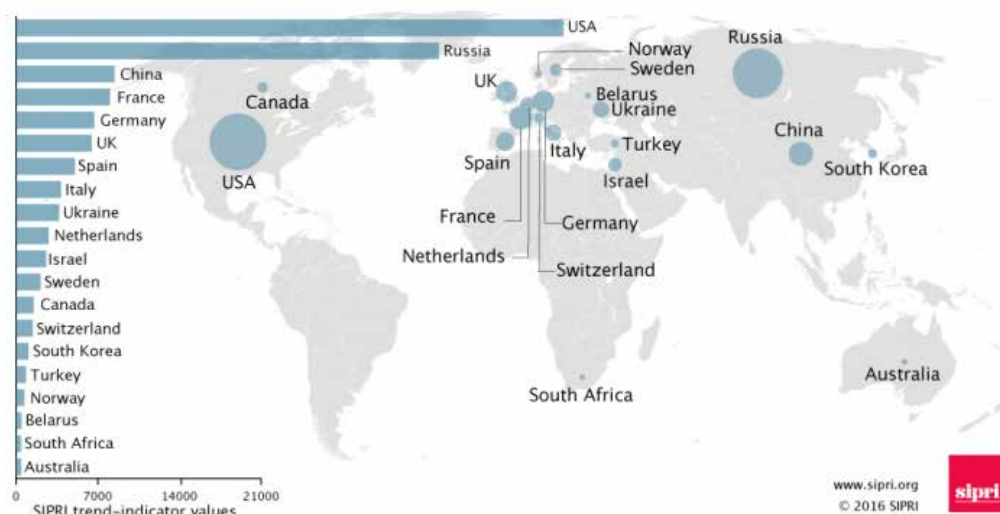
The 20 largest arms exporters 2011–15

We also believe that the feminist pacifist movement has a duty to regroup and develop strategies to change these ugly realities. We must not be passive observers as the world burns. We understand that there were ways to prevent this conflict, through cooperation, conciliation, peacebuilding, and disarmament and arms control. We are now faced with the total destruction of an ancient city, the gross violation of human rights, and a humanitarian catastrophe of nearly unprecedented proportions. We cannot keep saying "never again". We must work to ensure it, now. •