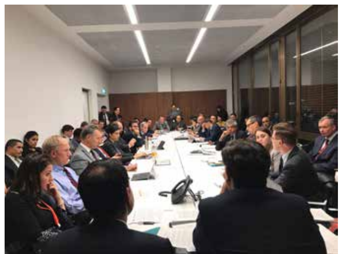
Small room meeting closed to civil society to negotiate the CCW high contracting parties final report, November 2019

And so much like First Committee survived its latest iteration despite geopolitical tensions, the unweaving of multilateral rules and commitments, and financial crisis, the CCW, too, is still standing—although becoming less transparent than ever before and more polarised. But those engaged in the work of trying to maintain the rule of law, prohibit weapons, and restrict the use of force need to ask, what can we do to not just preserve the institutions we have but to advance the agendas we set out for them? Can we protect the treaty bodies and the forums for discussion and negotiation without making that an end in itself? Remembering the mandates of these forums is essential, keeping the UN Charter’s commitment to ending the scourge of war for future generations at the core. If we are not advancing disarmament, if we do not approach weapon prohibition and restriction as necessary for international and human security, then these forums will inevitably fail—because we will have failed them.