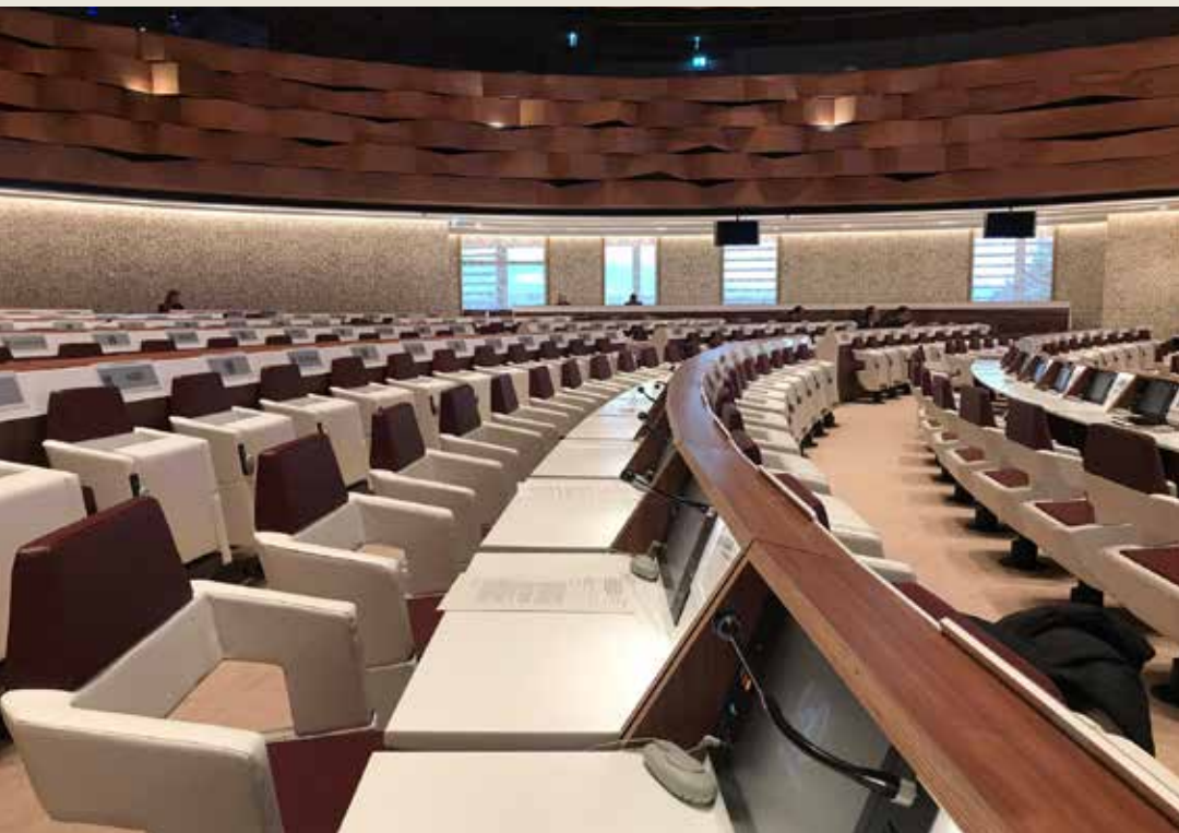
Empty plenary room during the Meeting of High Contracting Parties, November 2019