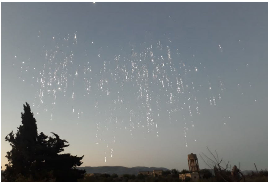
Photo: An incendiary weapon attack burned farmland in Badma, Idlib, in July 2018.