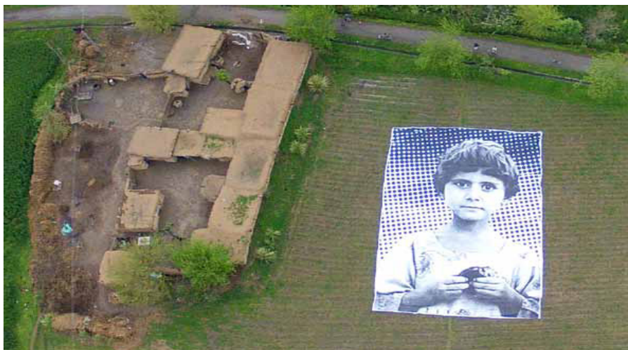
Photo: The Not A Bug Splat artist collective. Published by PAX in their report, Unmanned Ambitions.