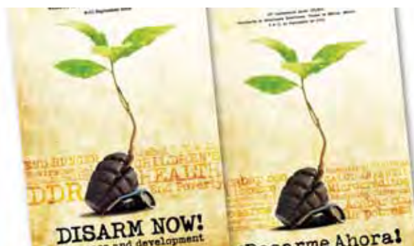
UN DPI/NGO Conference in Mexico City 2009: For Peace and Development: Disarm Now!

The debate thus far on the issues of militarization, arms racing, and proliferation show that misprioritization by governments affects human beings in two distinct ways. The first is that militarism and weapons lead to and intensify conflict and violence and inhibit the provision and protection of human rights in the most direct sense. The second way is the diversion of resources that indicates states’ failure to use their resources to build peace and security for human beings. •