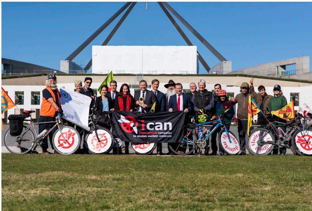
ICAN Australia Nobel Peace Ride ends in Canberra on 20 September 2018

Much work is needed on disarmament and arms control to protect civilians, enhance human security, and support development and peace. The general debate provides a snapshot of government interest in this subject. It seems that states, in the face of ever-growing global challenges, suffer from "a bad case of Trust Deficit Order," as described by the UN Secretary-General Guterres. Indeed, we need to rebuild trust. Yet, we can only build trust if we can actually believe what states proclaim when they are standing on the UN podium, speaking of peace. As Bolivia pointed out: "Many leaders, above all those that possess most of the weapons in the world, come to this Forum to talk to us about peace." But as long as militarism is prioritised over peace, these words will remain empty rhetoric. •