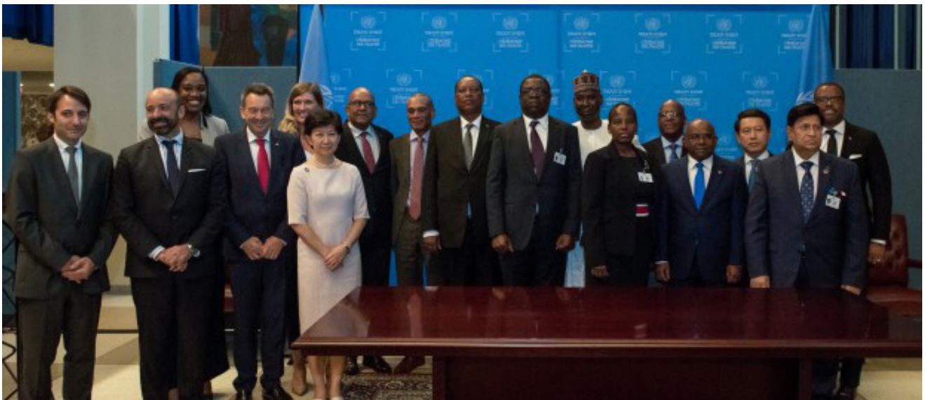
Ceremony for the Treaty on the Prohibition of Nuclear Weapons, 26 September 2019.

For the latter, this future lies with the TPNW. As the event heard from final speakers, elsewhere in the UN building several states joined the TPNW at a special ceremony. Nine countries signed the Treaty—Botswana, Dominica, Grenada, Lesotho, Maldives, St. Kitts and Nevis, Tanzania, Trinidad and Tobago, and Zambia—while five deposited their instruments of ratification—Bangladesh, Kiribati, Lao People’s Democratic Republic, Maldives, and Trinidad and Tobago. This brings the number of ratifying states to 32, and signatories to 79. These countries are prioritising people and peace over profits. As the prime minister of Saint Vincent and the Grenadines said in his remarks to the General Assembly on 27 September, smaller states have been “mere irrelevant pebbles in the eyes of some of the large, the rich and the powerful who ought to know better.” And now, these states “form part of the new foundation of international cooperation. Our challenges must be acknowledged, and our voices—long humoured but unheard—must be listened to as the consistent advocates on behalf of people, progress, partnership and principle.