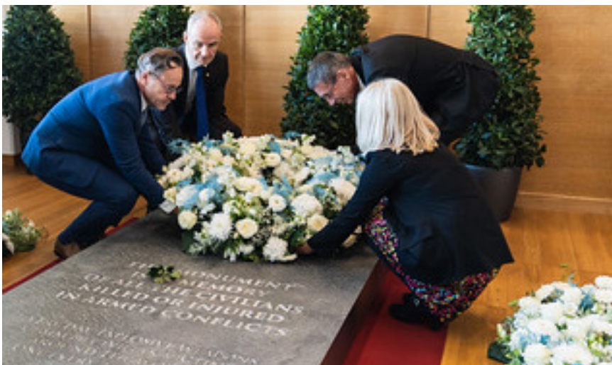
The Monument of the Unknown Civilian is a honours the lives of civilians lost due to urban bombing & shelling. It was inaugurated in Paris by Humanity and Inclusion, and presented at the Vienna Conference on Protecting Civilians in Urban Warfare.

Guatemala said the declaration could be a way to bring human rights to life. Lesotho urged this forum to call for a “conceptual shift away from just