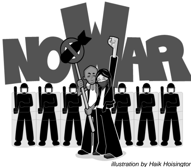
illustration by Haik Hoisington