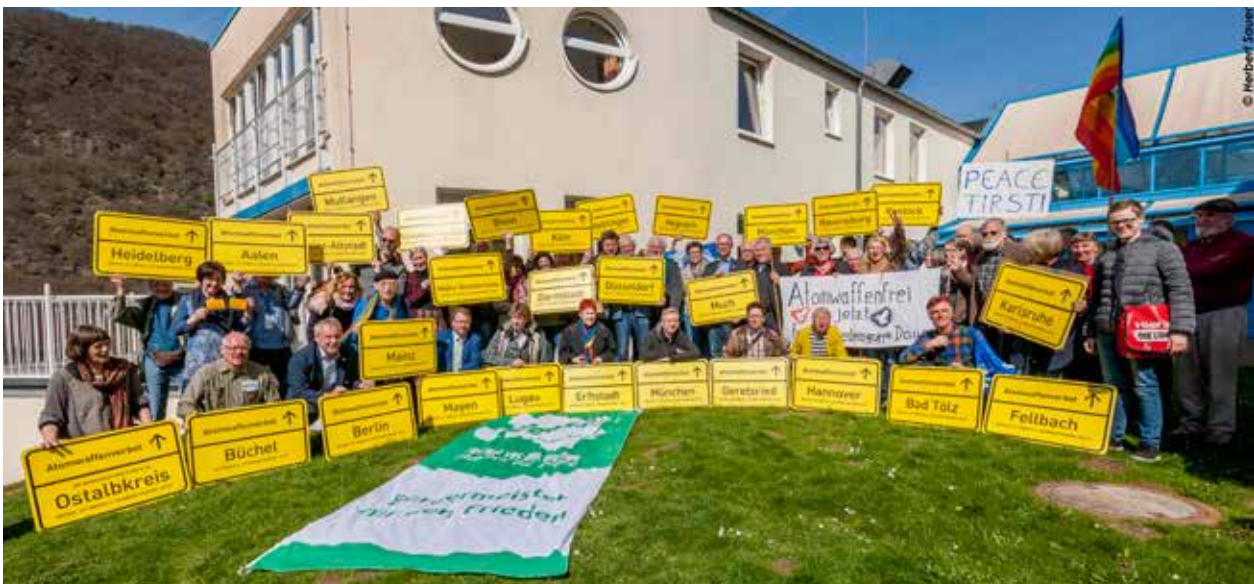
Mayors for Peace and Members of Peace Groups demand the ban of nuclear weapons in Germany with "City-Signs"

We therefore want to take the NPT PrepCom as an occasion to remember the historic importance of the INF Treaty and to contribute with a side event to the actual debate. This event will be held on Thursday, 4 May from 10:00–11:30 in M3. •