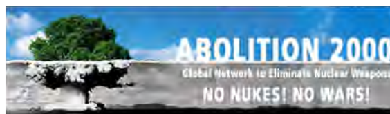
Abolition 2000 US-India Deal Working Group

Centre for Interdisciplinary Studies in Environment and Development, Bangalore/India