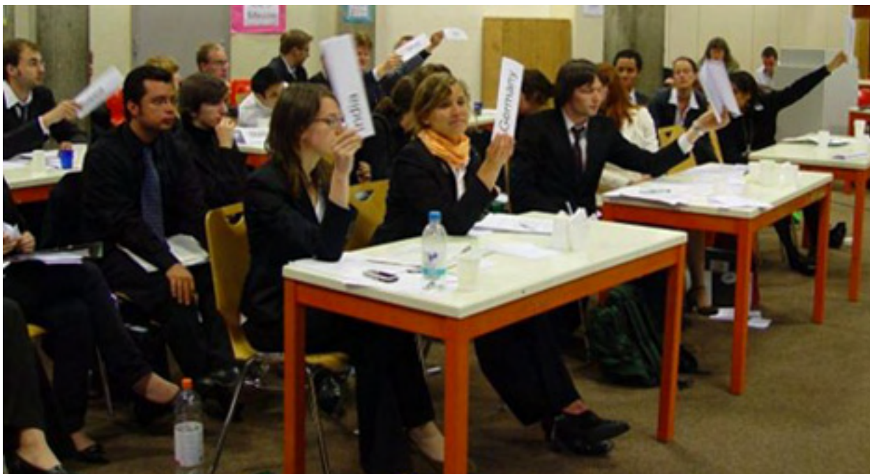
Youth negotiate a model Nuclear Weapons Convention