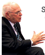
Sen. Douglas Roche The biography of the bomb