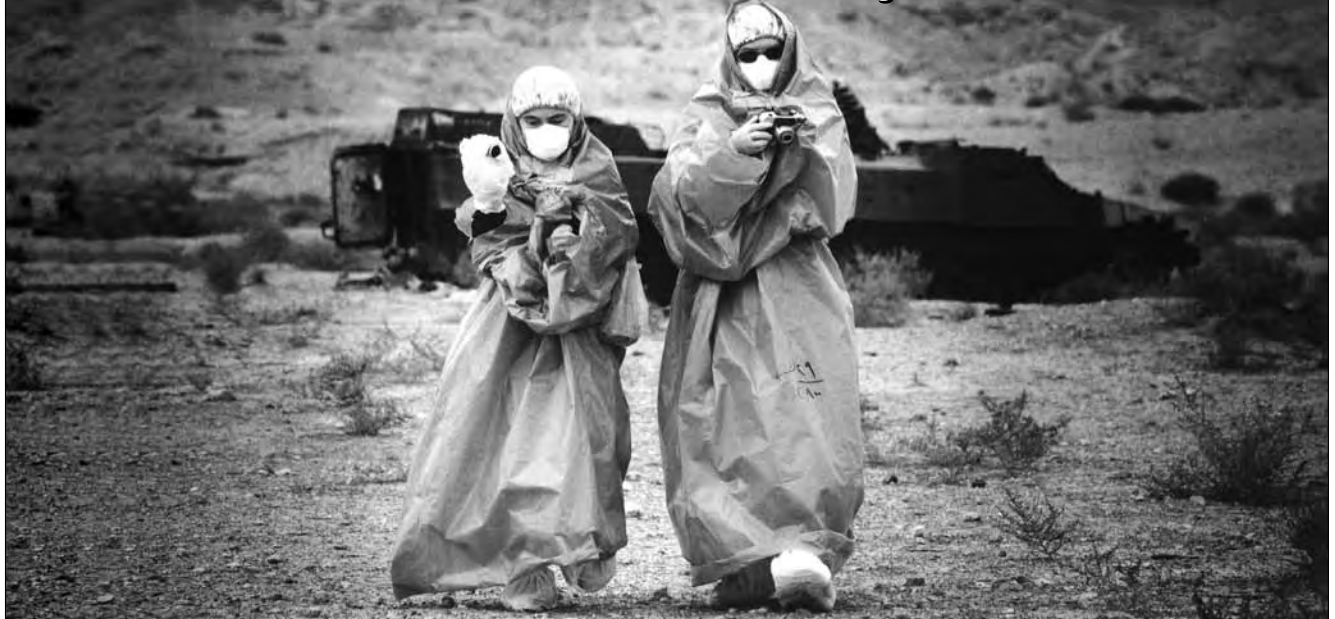
The Hiroshima survey team investigates the "Graveyard of Tanks" contaminated with radiation from DU. Basrah, Southern Iraq: Dec. 2002.

Radioactive and chemically toxic DU (Depleted Uranium) weapons can cause indiscriminate damage.