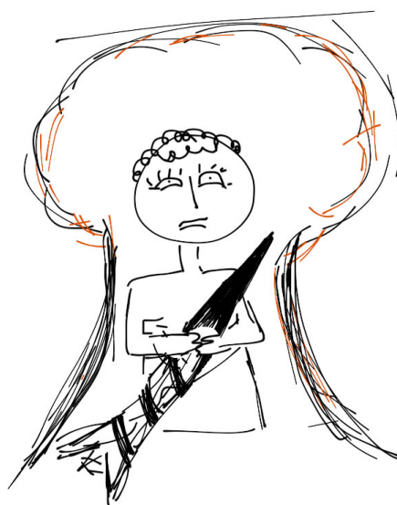
Cartoon by Susi Snyder

We're old enough to give up the "nuclear security blanket"