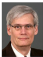
Bill Siksay MP Canada