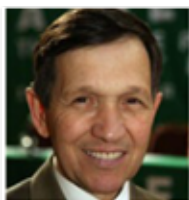
Dennis Kucinich US Congress (by video)