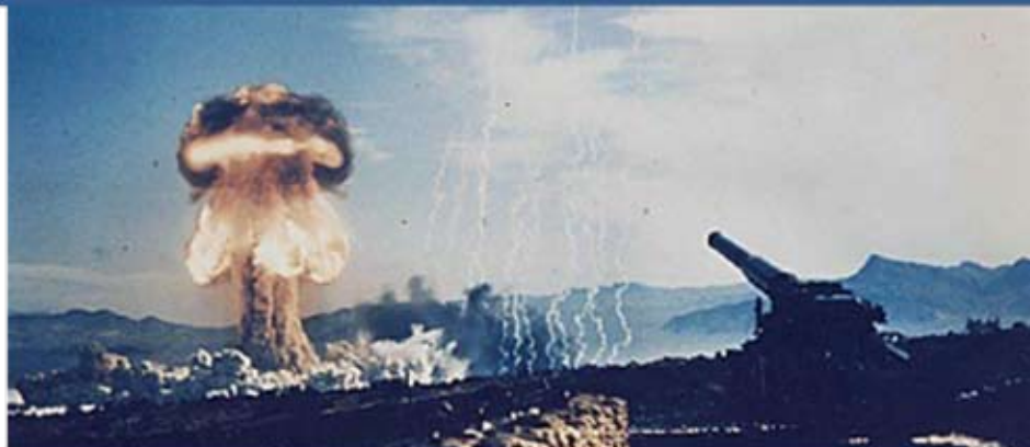
U.S. nuclear weapon test "Grable," Nevada, 1953.

6935 Laurel Ave., Suite 201 Takoma Park, MD 20912 USA Phone (+1) 301-270-5500 Fax (+1) 301-270-3029 E-mail ieer@ieer.org