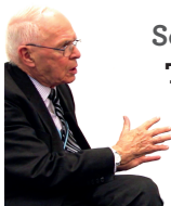
Sen. Douglas Roche The biography of the bomb