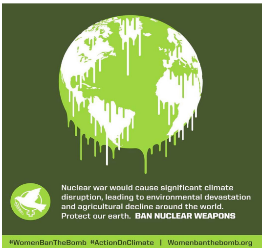
Graphic by Carlos Vigil