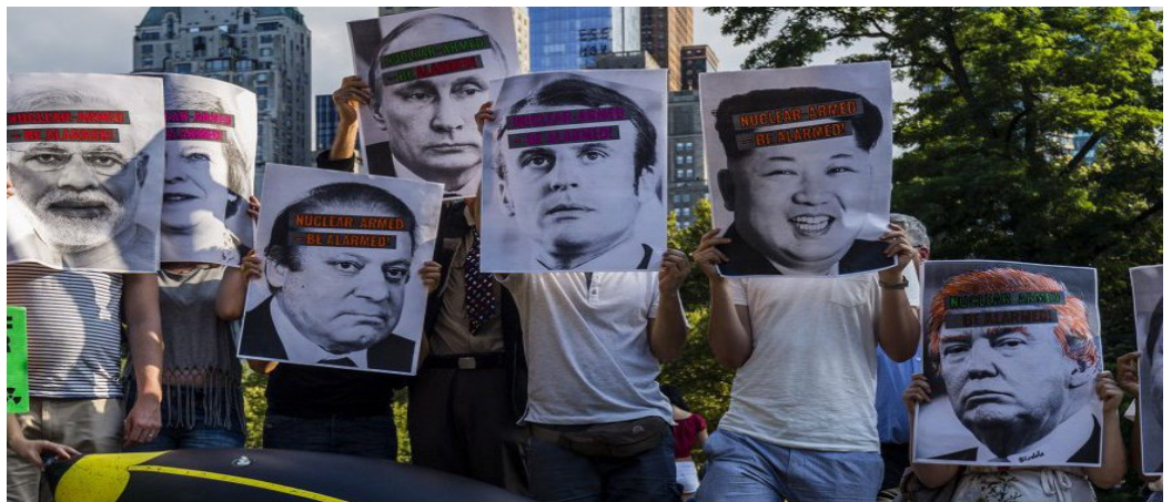
Photo: ICAN campaign stunt, New York, 2017 © International Campaign to Abolish Nuclear Weapons.