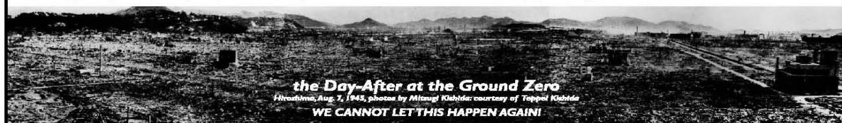
the Day-After at the Ground Zero

HANWA=Hiroshima Alliance for Nuclear Weapons Abolition: http://www.e-hanwa.org/ 8-23 Kami-Haccheburi, c/o CO-OP Association, Naka-ku, Hiroshima Email: info@e-hanwa.org Tel: +81-82-592-3850