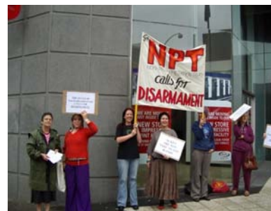
demonstration outside of the US Consulate in Perth, Australia, while the NGO presentations are delivered to the Review Conference in New York

The Australian Government continues its hypocritical stance of ignoring the obligation of the nuclear weapons states (especially our ally, the United States) to disarm, while focusing on the obligations of other nations to remain nuclear-weapon free.