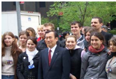
Hiroshima Mayor Akiba presenting the International Wall of Law with the German youth movement which built it.

The Mayors of Hiroshima and Nagasaki, Mayor Akiba and Mayor Itoh, presented more than 8 million signatures to President Duarte calling for the complete elimination of nuclear weapons. Yoko Ono, the artist survivor of the Tokyo fire bombings during World War II, closed her statement by saying that, "A dream you dream alone is only a dream. A dream you dream together is reality. Imagine Peace".