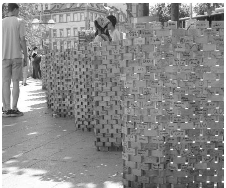
International Law Campaign's Wall, the People's Growing Movement

From 6- 9 PM, there will be a closed meeting of the 2000 Global Council Meeting.