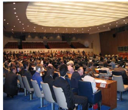
A packed Conference Room IV listening to the NGO statements.

Now that , distinguished delegates, is a conference.